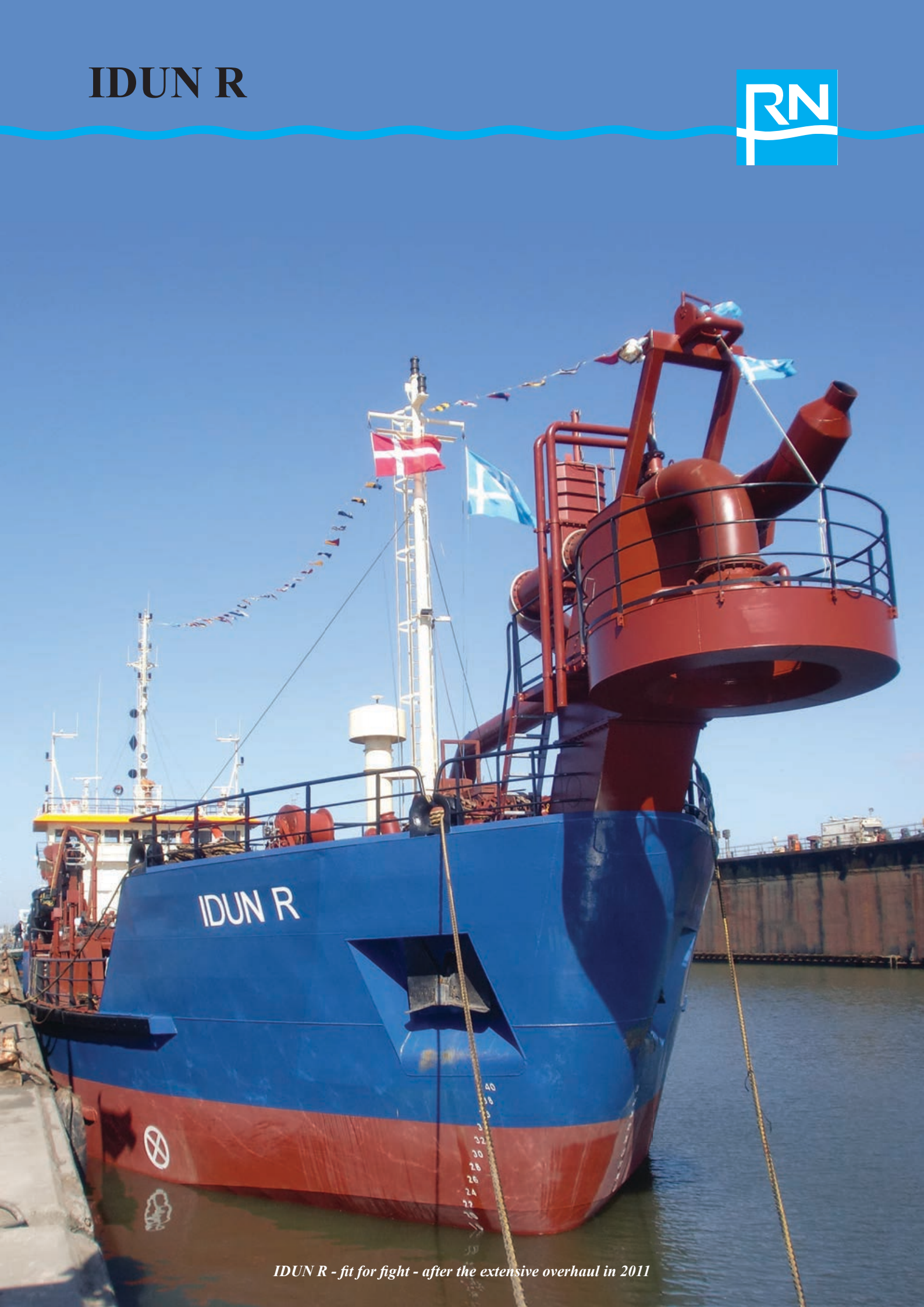
IDUN R - fit for fight - after the extensive overhaul in 2011